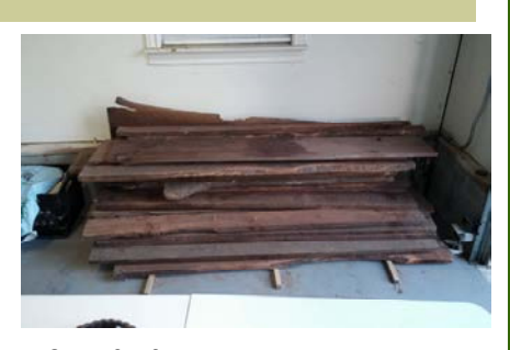
125 bf of rough walnut

This column is focused on the issues of the beginning woodworker. We all had to start somewhere in our learning about woodworking and this writer is still a novice in so many ways. We welcome the new members to the woodworking guild no matter the city or location. We approach the work with full realization that there is much to be learned and many opinions on how to approach the challenges of learning to work in wood. All help and advice is welcomed. We learn so that we can teach the love of woodworking and a guild is the very best place to practice the art of learning and teaching woodworking.