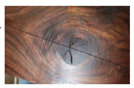
Star-burst cracks in the knots

My particular problem this month is related to a special gift that I received in October, 2014. I have this friend who "gave" me an uncommon stack of Black Walnut that has been sitting in a shed on Smith Lake, Al. since it was milled by his father some 55 years ago. It is 125 bd ft of very brittle, dry and light, checkered, dusty wood that has knots with star-burst cracks in every single board. The boards are mostly I" rough cut, about 10" wide and 5-6 feet long. He wants for me to gift him with a "Hope Chest" from his father's wood.